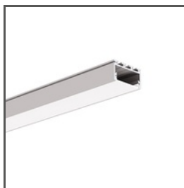
GIZA-LL A00758 Ref. arch C0758