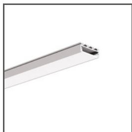
GIZA A05556 Ref. arch B5556