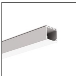
LIPOD A05554 Ref. arch B5554