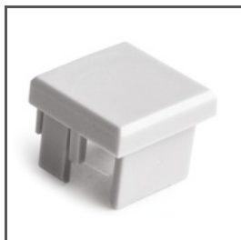
END CAP M-K C24216C02

RELATED ACCESSORIES > OTHER RELATED ACCESSORIES > REGULAR END CAPS