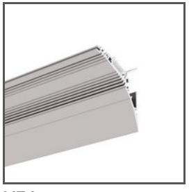
LIT-L A18033 Ref. arch 18033